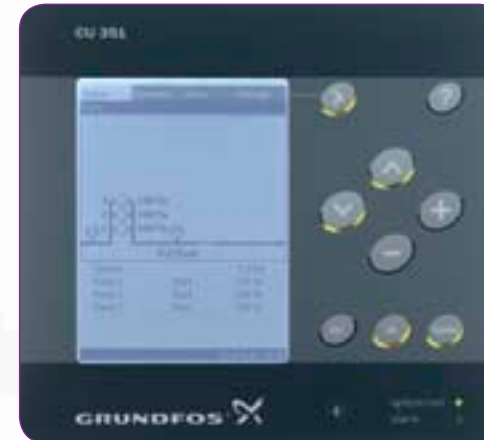
The CU 351 has a large intuitive LCD display providing a user-friendly interface

Connecting Control MPC to a computer lets you monitor and control your system from a distance. This gives you easy and unlimited access to system performance and lets you optimise system settings without getting your hands dirty.